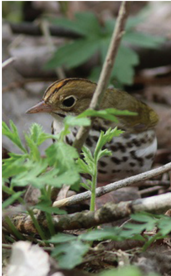
Ovenbird. This warbler nests on forest floors and depends on spiders for part of its food source.