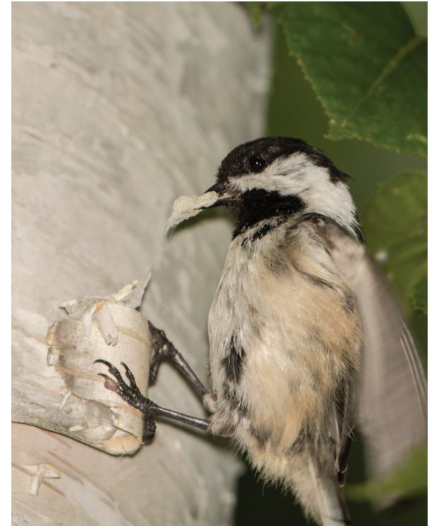
Chickadee with egg case (eggs).

Spiders are not aggressive. They prefer avoiding humans; we are far more dangerous to them than they are to us. Spider bites are extremely rare. In the U. S., there are only two seriously venomous species: Black widow and brown recluse. But even their bites are uncommon and rarely cause serious issues.