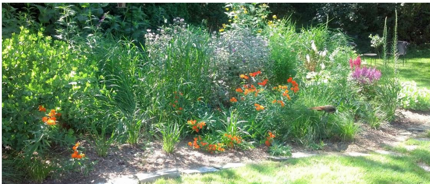
Schroeck pollinator garden.