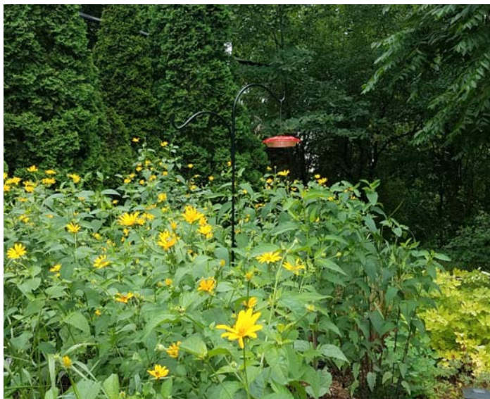
False Sunflower for pollinator garden.