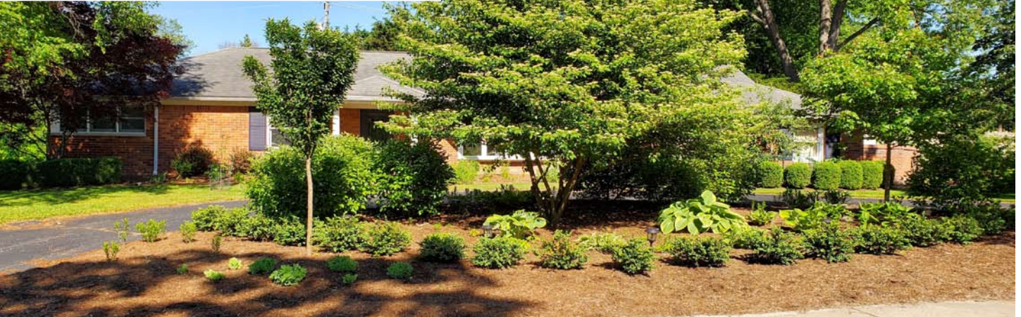
Schroeck front lawn...now.

We bought our home on a half-acre lot in Bloomfield Township, Michigan in May of 2010. The yard was a boring canvas of turf grass. Fortunately, the back yard had several different species of pine trees planted along the property line and a couple of big, mature silver maple trees along one side. The landscaping was minimal; just day lilies and evergreen shrubs.