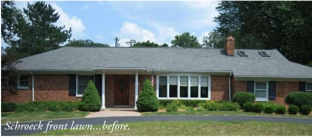
Schroeck front lawn...before.