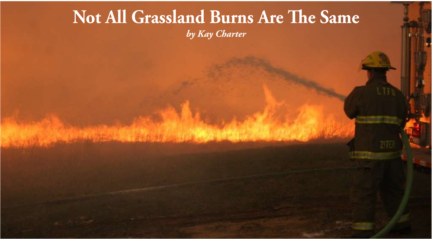
Charter Prairie burn several years ago.

For the past dozen or so years, the Leelanau Township Fire Department has conducted prairie burns on Charter Sanctuary as training sessions for grassland fires. Grassland ecosystems are essential to a number of declining bird species like meadowlarks and bobolinks. In order to eliminate thatch and keep unwanted woody species like autumn olive – or even native brambles – at bay, burning is essential. Such burns are conducted every 2 - 3 years.