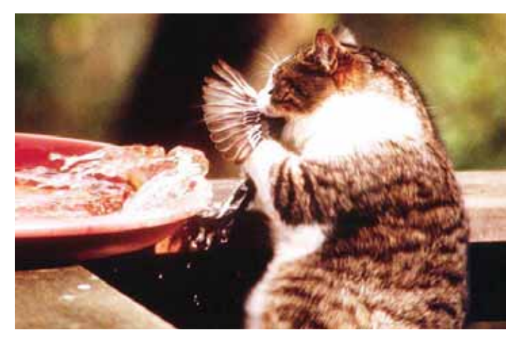
Cat killing yellow-rumped warbler