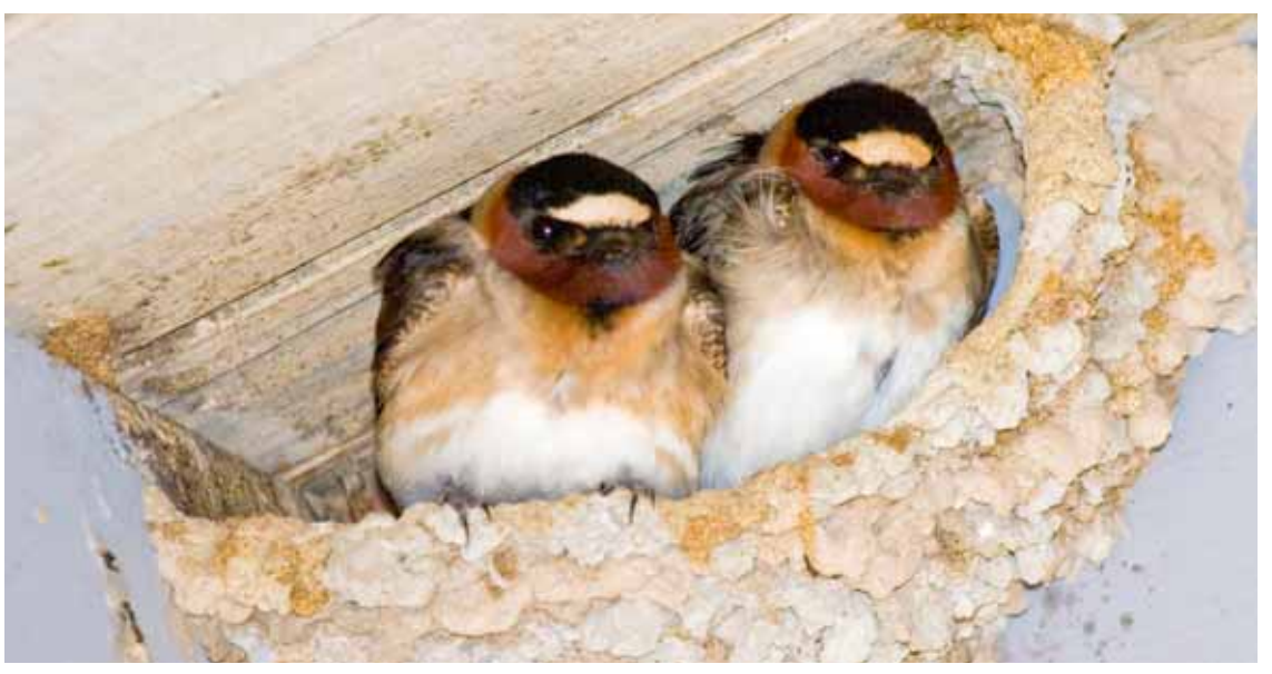
Cliff swallow nestling photo by Robert Epstein. The Morrisons host dozens of pairs every year.

Like a horde of biblical locusts they came flying in, but they weren't locusts, they were our cliff swallows coming home. Cliffies are fun to observe, and observe them you will if they nest on your house because they will be right above your head all day. One really can feel good at the end of the day looking up and seeing 150 or more cliffies sitting on power lines, flying overhead, skimming your stock pond for water, and even still darting in and out of the nests feeding their second clutch. You know you had a trivial part in making it happen. However, when admiring your cliffies it is wise not to stand directly under the flight pattern and gaze straight up. There is a good reason why the grass under the nest area is dead.