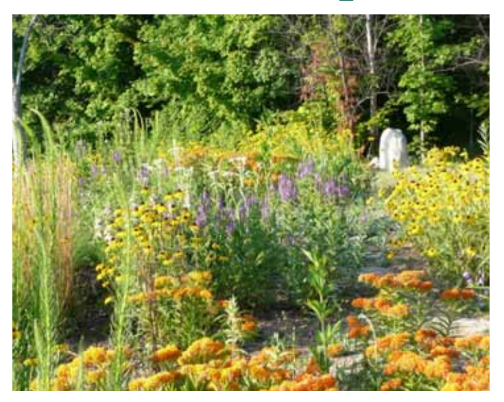
SBTH Prairie Demonstration Garden in mid-summer