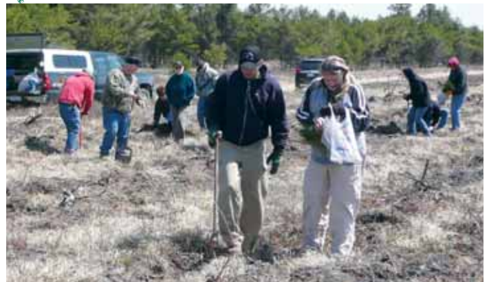
Fairmount Minerals Quest Team planting jack pines

Saving Birds Thru Habitat, Conservation Resource Alliance (CRA), and several Michigan DNR staff members, facilitated this project. The cost was entirely underwritten by Fairmount Minerals. It is a wonderful example of a way in which partners can work together to benefit the planet (improving habitat), the company (sequestering carbon), the state (reducing costs for conservation work) and NGO's (fulfilling their missions). Both SBTH and CRA look forward to an ongoing partnership with Fairmount on this project.