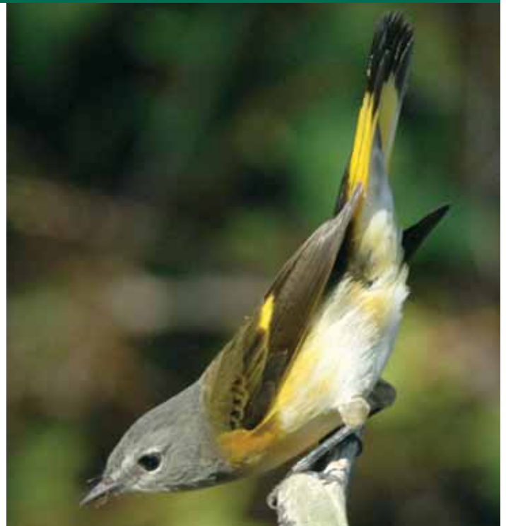
Female American Redstart