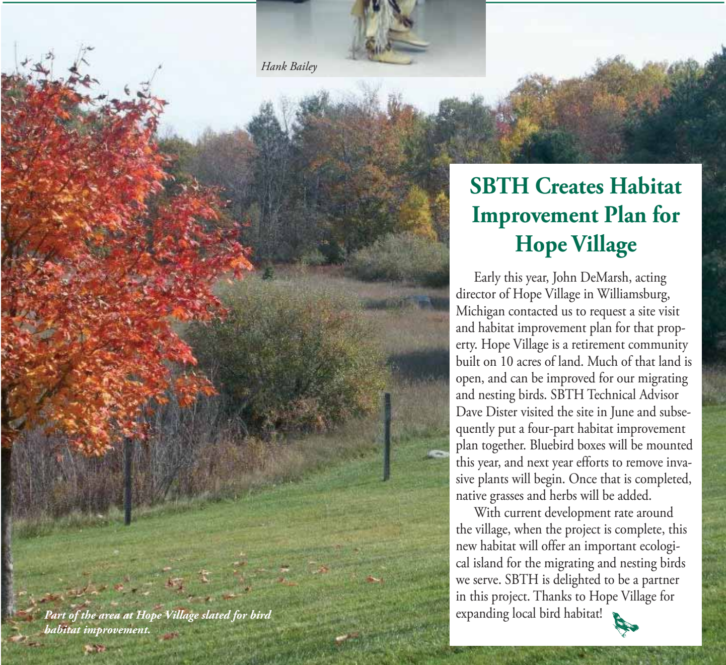
Part of the area at Hope Village slated for bird habitat improvement.