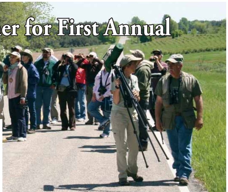
BirdFest attendees at the Grand Traverse Regional Land Conservancy's Arcadia Dunes prairie

Check out the new BirdFest website at: www.mibirdfest.com