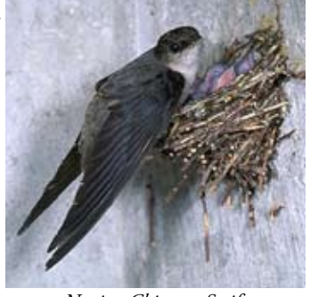
Nesting Chimney Swift

Stay tuned; we will let you know when we get our first nesting pair. 🐧