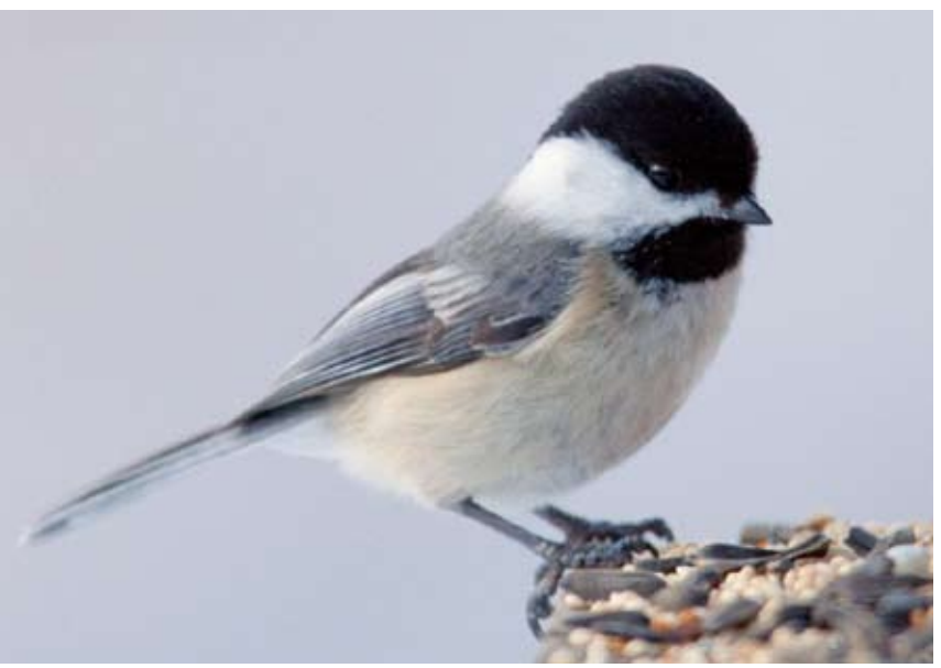
Black-capped Chickadee