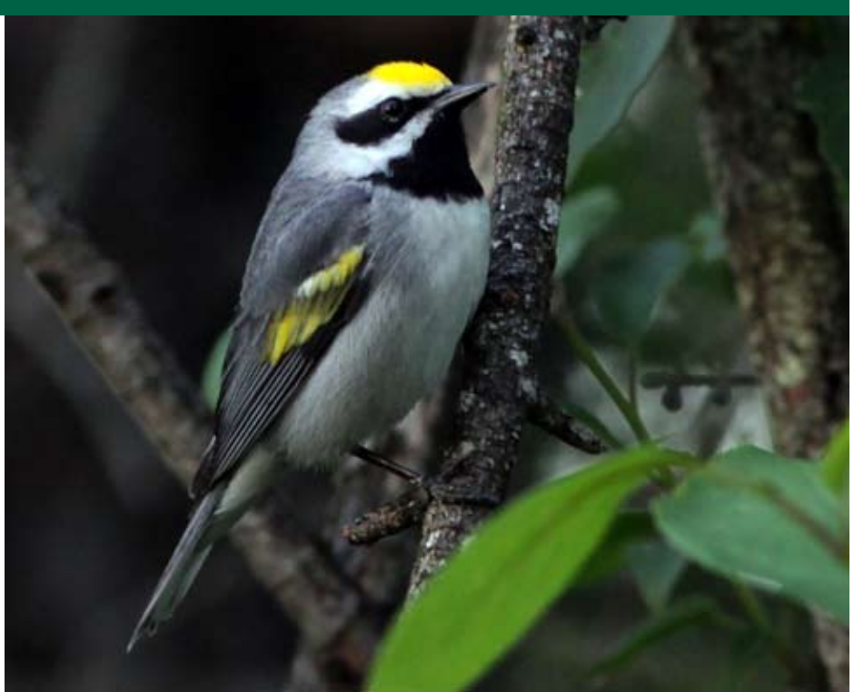
Photo of Golden-winged Warbler

We couldn't pass up professional photographer Cindy Mead's offer to allow us to use her beautiful image of the Golden-winged Warbler. This elegant little bird nests on or near the ground in shrubby edges, dense thickets or overgrown pastures. It feeds on insects, especially small caterpillars and some spiders - another reason not to use insecticides out of doors. Golden-winged Warblers sometimes swing upside down from twigs like chickadees searching for "inch worms." A species that benefited from open, second-growth woodlands after massive clear-cutting in the late 1800's, populations are now declining as forests return...a good reason to include some clearcuts in forest management programs.