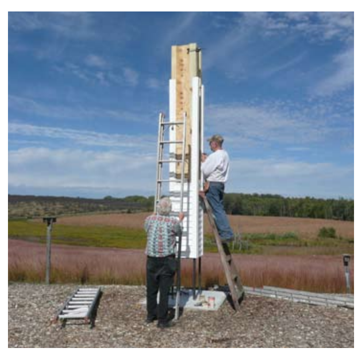
Volunteers Jim Charter and Jerry Kalchik spent many hours building the Chimney Swift towers. Towers overlook prairie restoration on Charter Sanctuary.