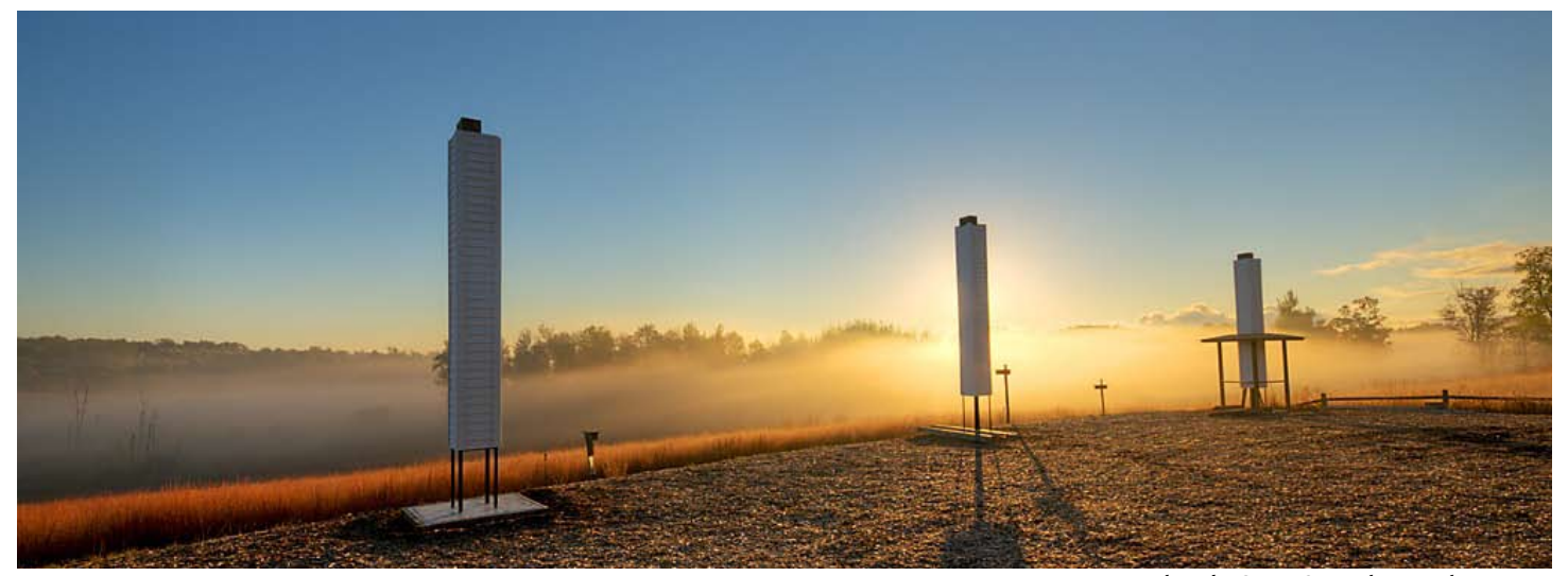
No – This is "Swifthenge!"

Late in August we received an unexpected, and very welcome grant, thanks to Conservation Resource Alliance for Chimney Swift nesting structures. Chimney Swifts, often called "flying cigars," arrive in early May in our area and begin searching for suitable nesting