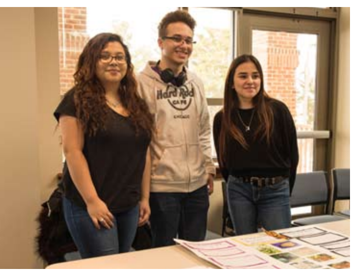
Leland High School Ecology and Conservancy Class

Students from Glen Lake and Leland High Schools participated in the formal launch of the initiative on April 18th.