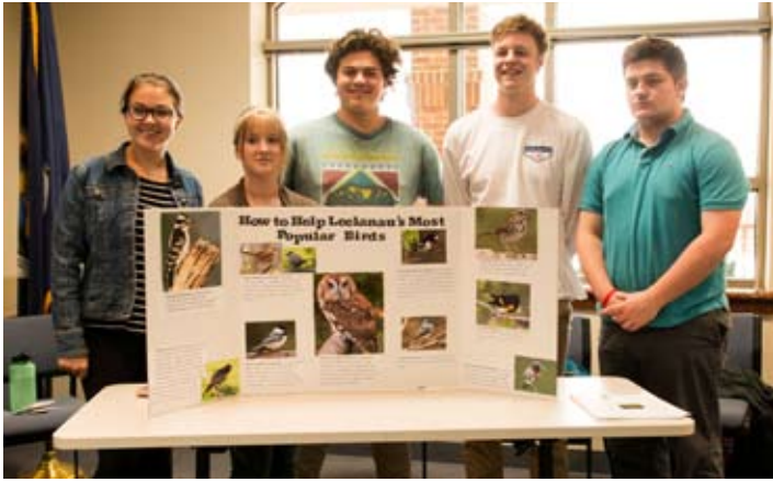
Leland High School Ecology and Conservancy Class