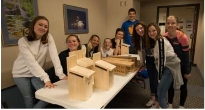
Glen Lake High School Envirothon Group

One third of North America's birds are currently at risk of extinction. Native bees and butterflies are similarly at risk. Although tragic, this is no reason to descend into gloom and doom. Rather the situation is a call to action for those of us who care about the future for all of our wildlife.