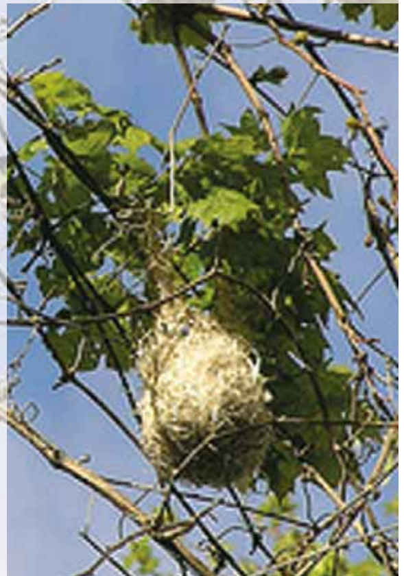
Baltimore Oriole Nest