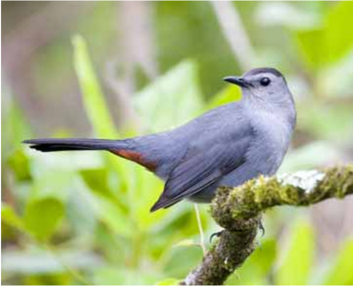
Planting a dense hedgerow of native shrubs will provide a welcome nesting site for Gray Catbirds